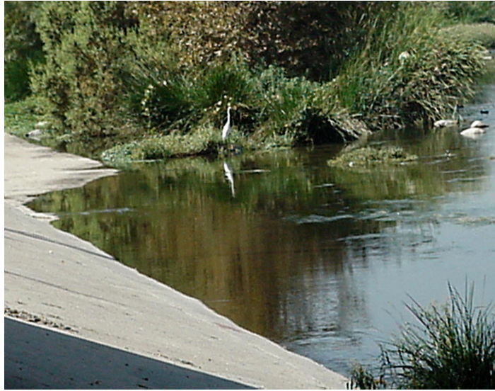
Figure B. Fletcher Drive: Great Egret, October 26, 1999.

From Figueroa Street to Washington Boulevard, the river supports several beneficial uses, including the Downtown Channel, which is used by many for recreation and bathing, in particular by homeless people who seek shelter there.