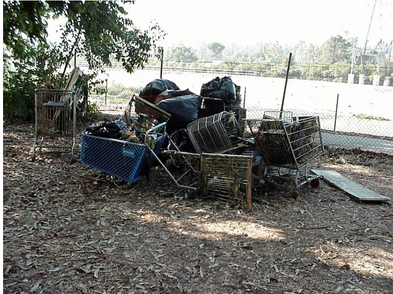
Figure C. Trash waiting for pick-up at Los Feliz Boulevard after the Sunday, October 16, 1999 river clean-up.

Several studies which attempted to quantify trash generated from discreet areas have been completed, but they concern relatively small areas, or relatively short periods, or both. The findings of some of these studies are discussed below.